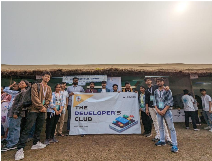
Team DevCom representing at Bodoland International Knowledge Festival