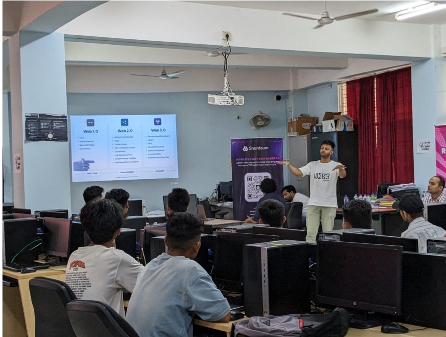
Workshop on “Deploying your first smart contract” in collaboration with Web3Assam

Overall, DevCom has become an integral part of the institute's technical community, and it continues to inspire and motivate students to pursue their passion for technology. Whether you are a beginner or an experienced developer, DevCom offers a welcoming space for you to learn, connect, and grow as a technical professional.