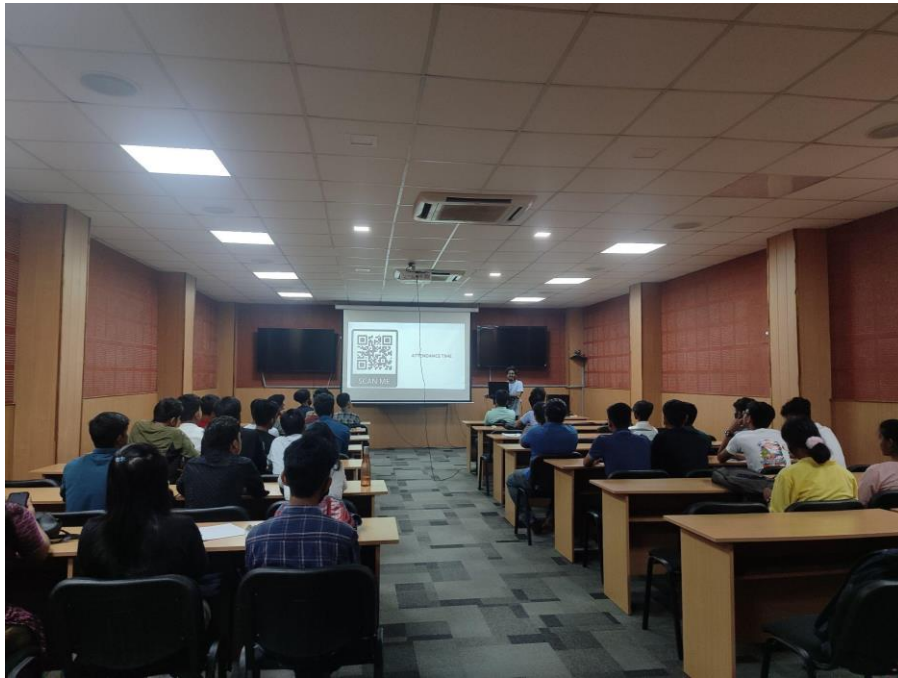
Web Development Bootcamp