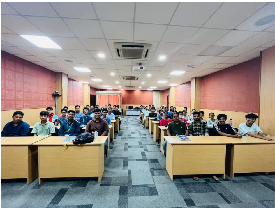
Club Orientation for Year 2022

DevCom Club is open to all students who are interested in web or app development, regardless of their level of experience. Whether you're a complete beginner or an experienced developer, there's something for everyone in this club. Members have the opportunity to learn new skills, share their knowledge with others, and work on real-world projects that can help them build their portfolios.