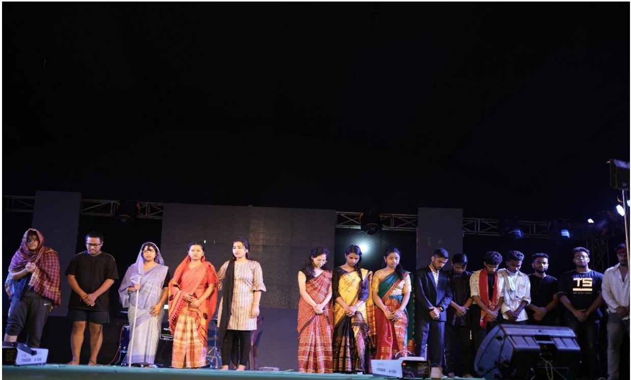
Manuhe Manuhor Babe, a poetic play, Performance at the Stage of Ecstasy 2022

The club's repertoire of activities is truly impressive. Xopun has collaborated with various organizations, and production houses to expand its reach and impact. The club has also participated in several awareness programs, using the power of drama to educate and inspire audiences on critical social issues. But it is the club's performances that truly steal the show. The club's performances are a feast for the senses, from street plays to stage plays. The actors display a remarkable range of emotions, bringing the characters to life with a realism that is both impressive and captivating. The themes of the plays are diverse and thought-provoking, making the audience reflect on the world around them.