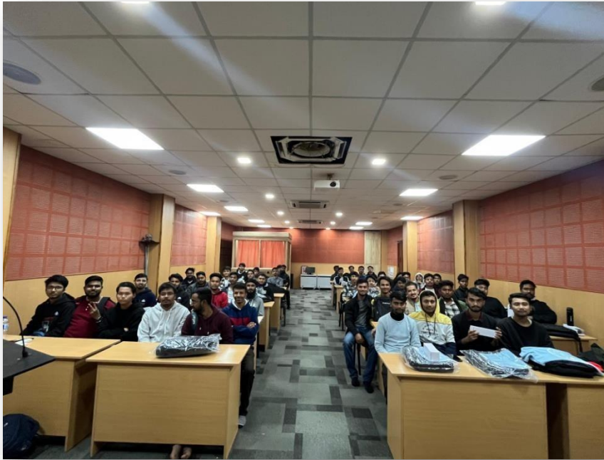
Students receiving swags for successfully completing the 30-day google cloud program.