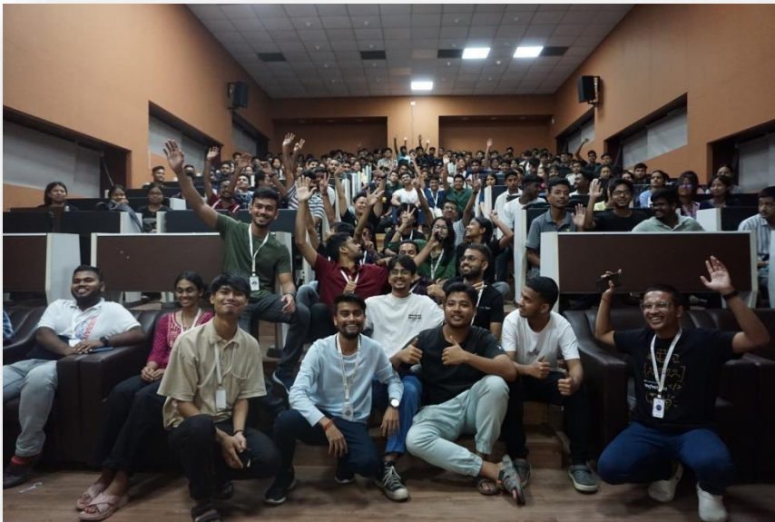
GDSC inauguration day-28 th August,2023

In the fast-paced world of technology, staying ahead of the curve is essential. That's why on the 28th of August 2023, a beacon of innovation was lit with the inauguration of GDSC CITK (short for Google Developer Student Clubs, Central Institute of Technology Kokrajhar). Since its inception, GDSC CITK has been on a mission to empower students and explore the realms of technology through a diverse array of domains. This club has quickly become a hub for students eager to dive into the world of technology and entrepreneurship. The club, GDSC, offers a range of activities aimed at exploring and learning about technology.